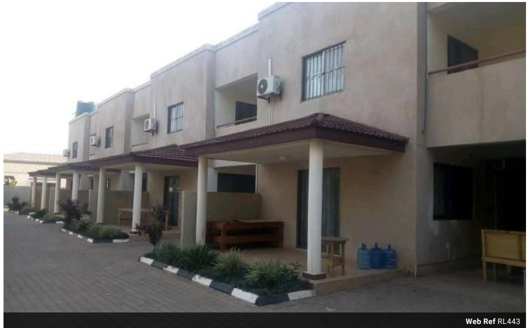
Web Ref RL443

403A Lilayi Road, Lilayi, Lusaka, Zambia