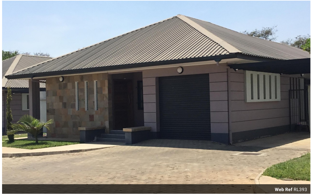
Web Ref RL393

403A Lilayi Road, Lilayi, Lusaka, Zambia