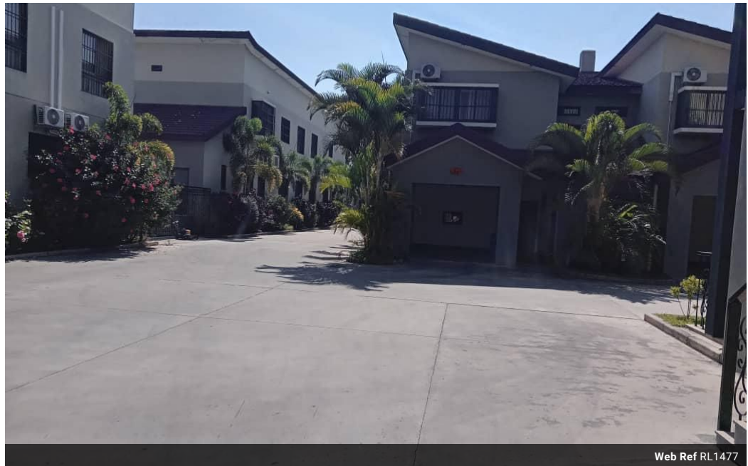
Web Ref RL1477

403A Lilayi Road, Lilayi, Lusaka, Zambia