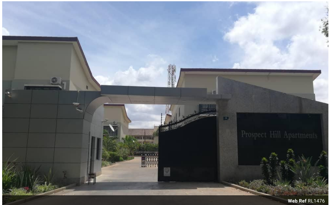
Web Ref RL1476

403A Lilayi Road, Lilayi, Lusaka, Zambia