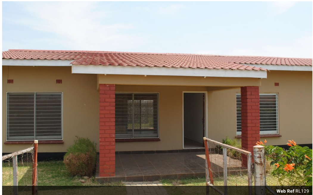
Web Ref RL129

403A Lilayi Road, Lilayi, Lusaka, Zambia