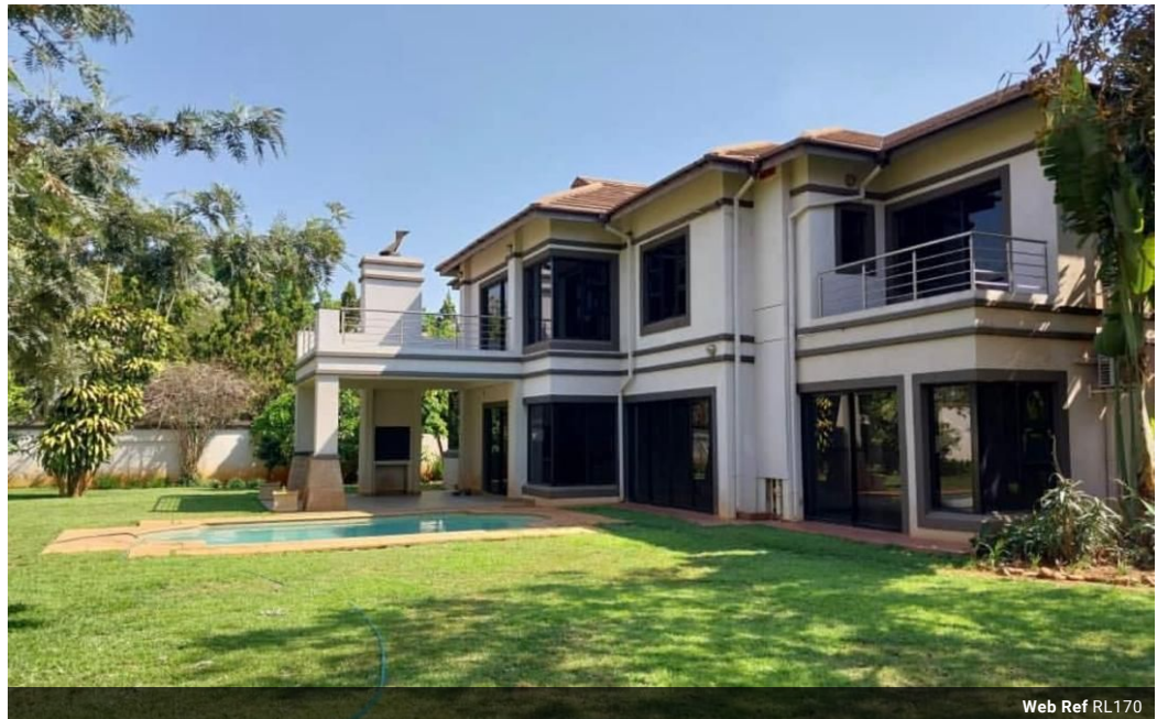
Web Ref RL170

403A Lilayi Road, Lilayi, Lusaka, Zambia