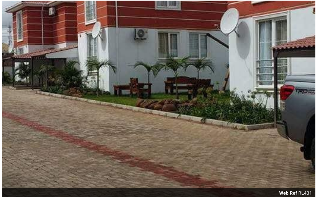
Web Ref RL431

403A Lilayi Road, Lilayi, Lusaka, Zambia