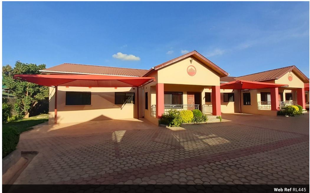
Web Ref RL445

403A Lilayi Road, Lilayi, Lusaka, Zambia