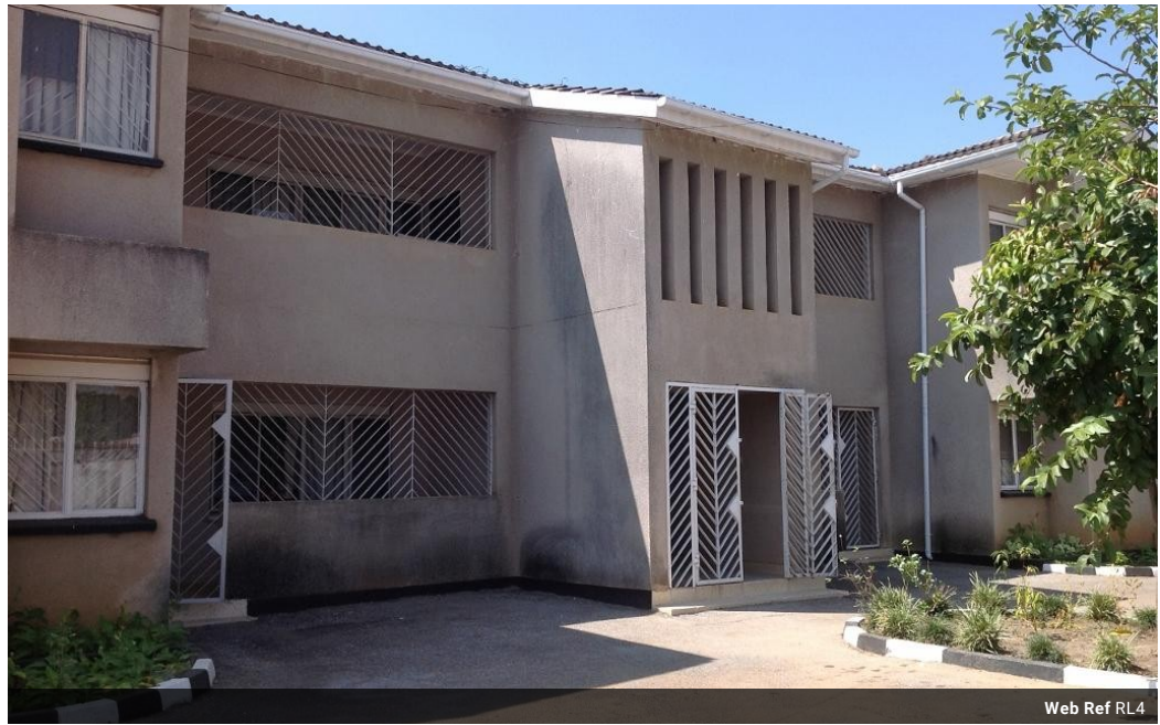
Web Ref RL4

403A Lilayi Road, Lilayi, Lusaka, Zambia