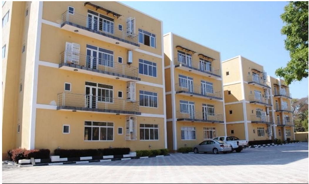
Web Ref RL265

403A Lilayi Road, Lilayi, Lusaka, Zambia