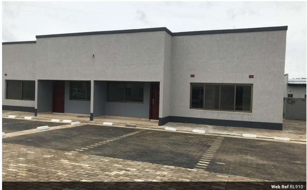
Web Ref RL910

403A Lilayi Road, Lilayi, Lusaka, Zambia