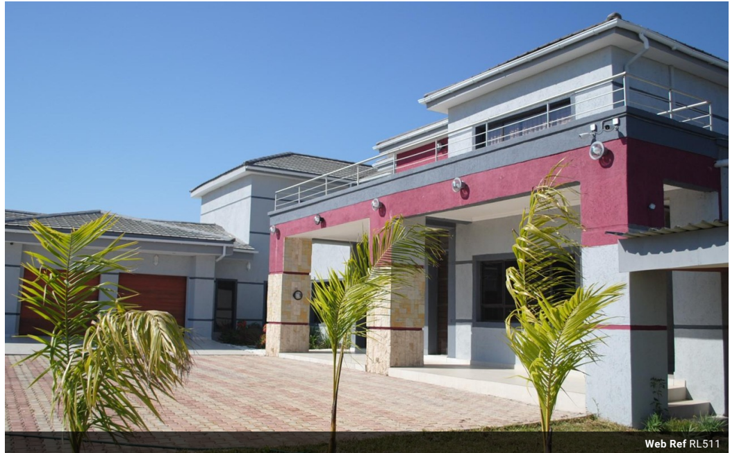
Web Ref RL511

403A Lilayi Road, Lilayi, Lusaka, Zambia