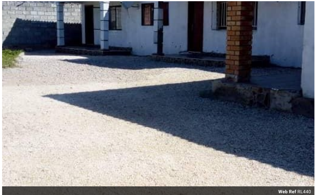
Web Ref RL440

403A Lilayi Road, Lilayi, Lusaka, Zambia