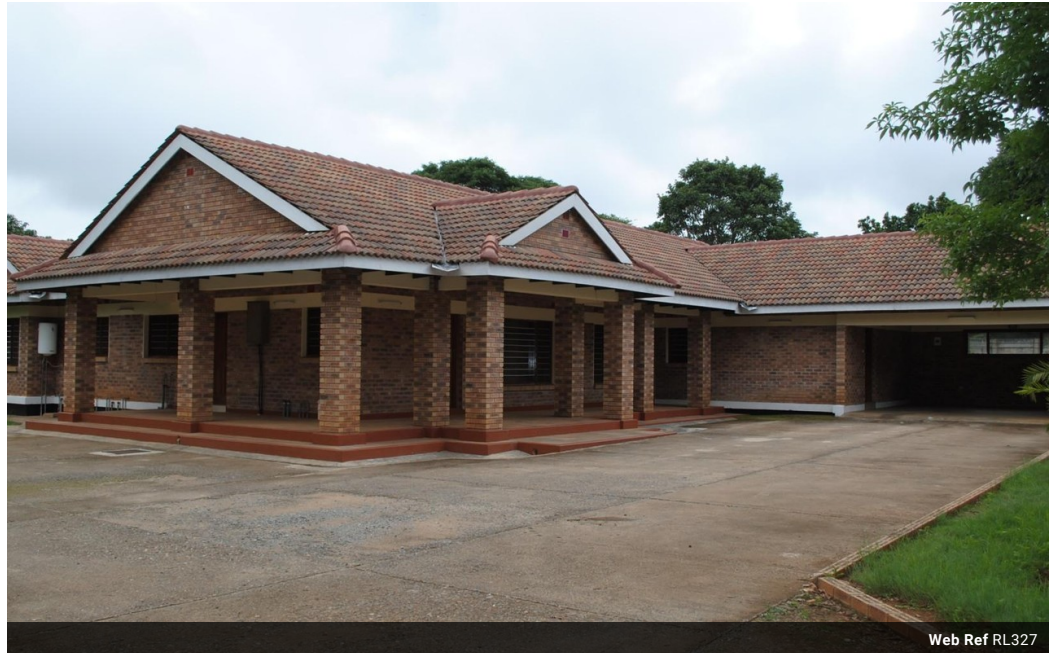
Web Ref RL327

403A Lilayi Road, Lilayi, Lusaka, Zambia