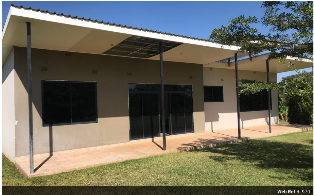
Web Ref RL970

403A Lilayi Road, Lilayi, Lusaka, Zambia