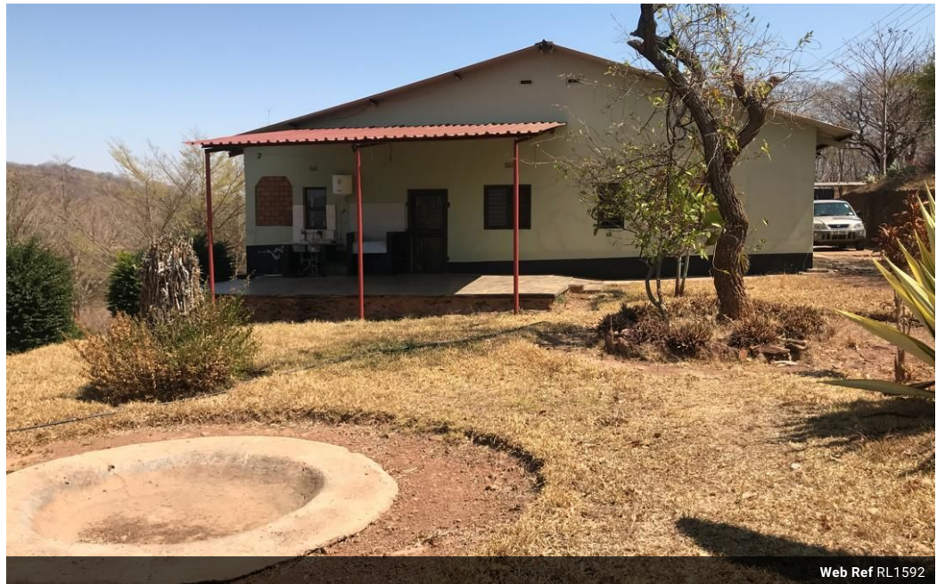
Web Ref RL1592

403A Lilayi Road, Lilayi, Lusaka, Zambia