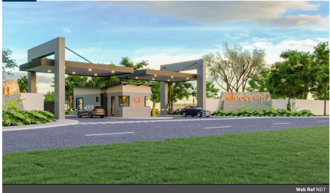
Web Ref ND7