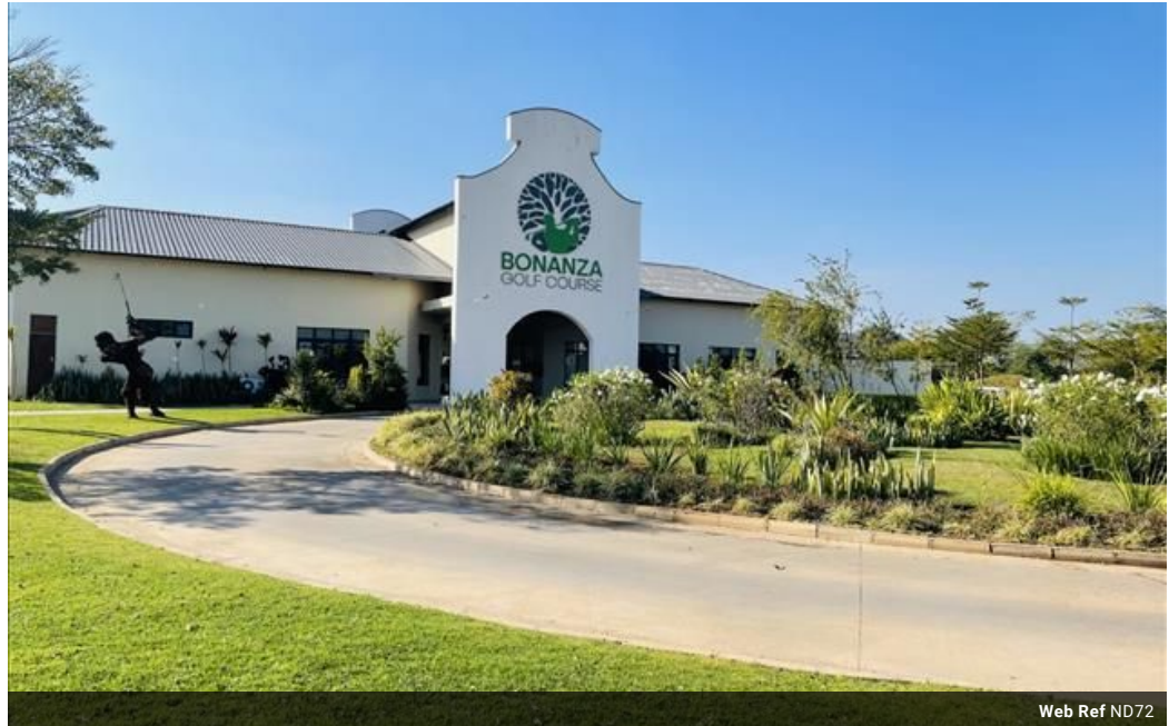
Web Ref ND72

403A Lilayi Road, Lilayi, Lusaka, Zambia