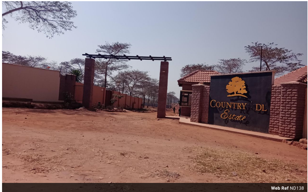
Web Ref ND138

403A Lilayi Road, Lilayi, Lusaka, Zambia