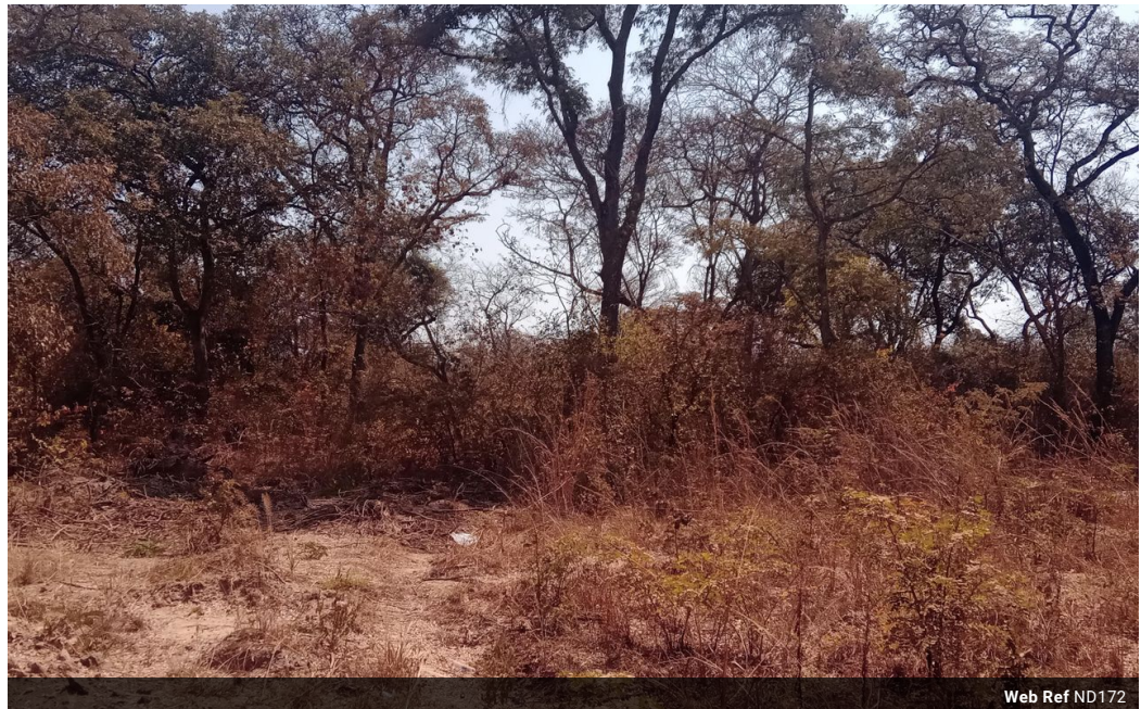
Web Ref ND172

403A Lilayi Road, Lilayi, Lusaka, Zambia