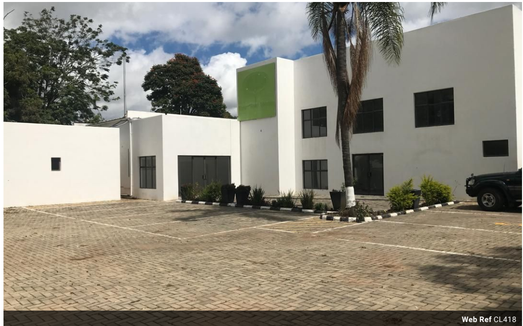
Web Ref CL418

403A Lilayi Road, Lilayi, Lusaka, Zambia