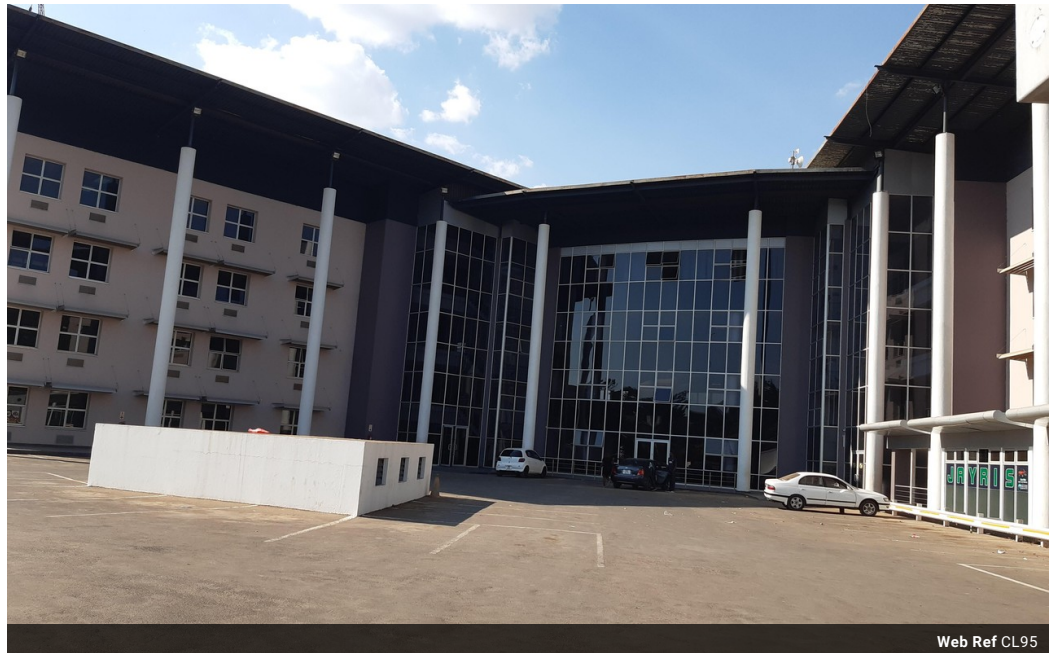
Web Ref CL95

403A Lilayi Road, Lilayi, Lusaka, Zambia