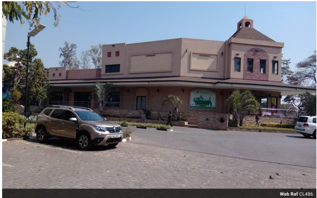
Web Ref CL486

403A Lilayi Road, Lilayi, Lusaka, Zambia