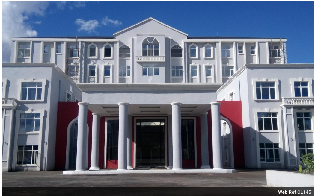
Web Ref CL145

403A Lilayi Road, Lilayi, Lusaka, Zambia