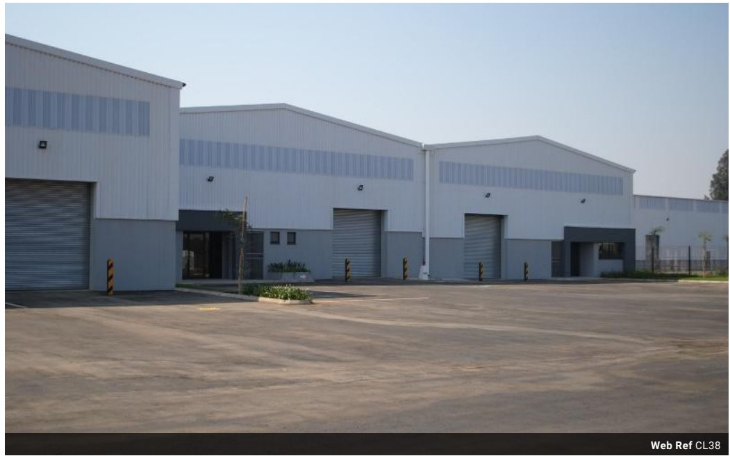
Web Ref CL38

403A Lilayi Road, Lilayi, Lusaka, Zambia