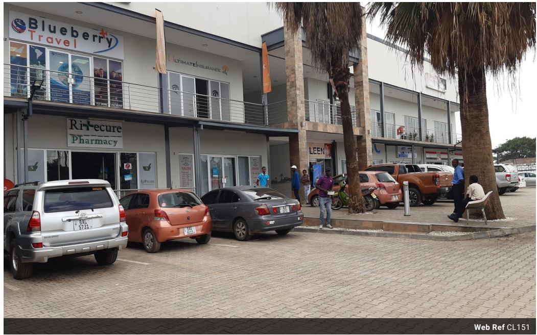
Web Ref CL151

403A Lilayi Road, Lilayi, Lusaka, Zambia